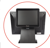
9.7 inch Second display Non-Touch