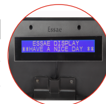
20 chars x 2 lines Customer Display